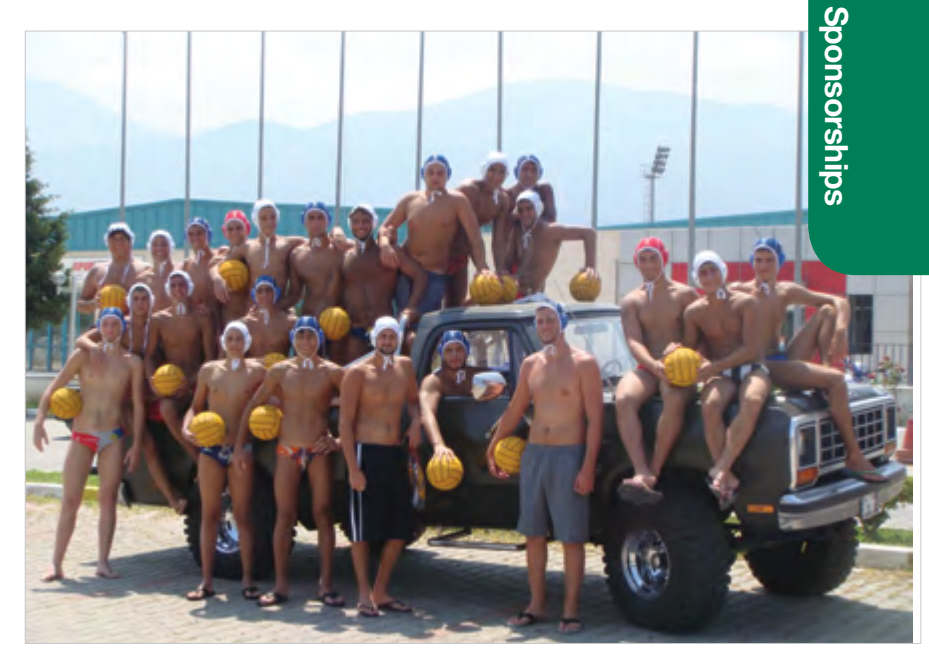
MSSK Water Polo Team