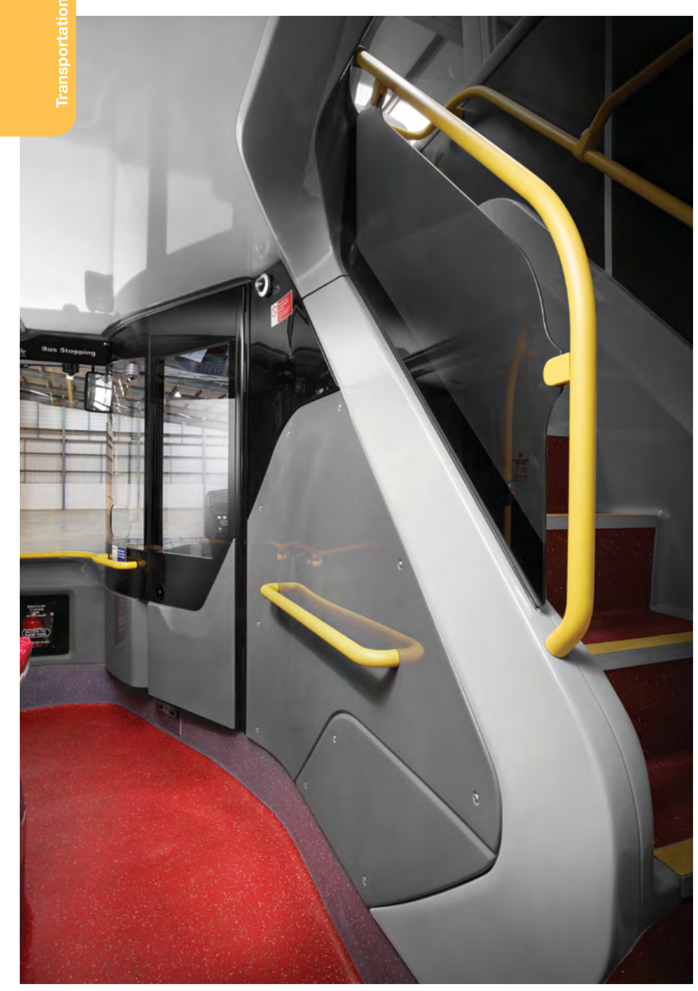
Enviro400 Driver Area and Stairs