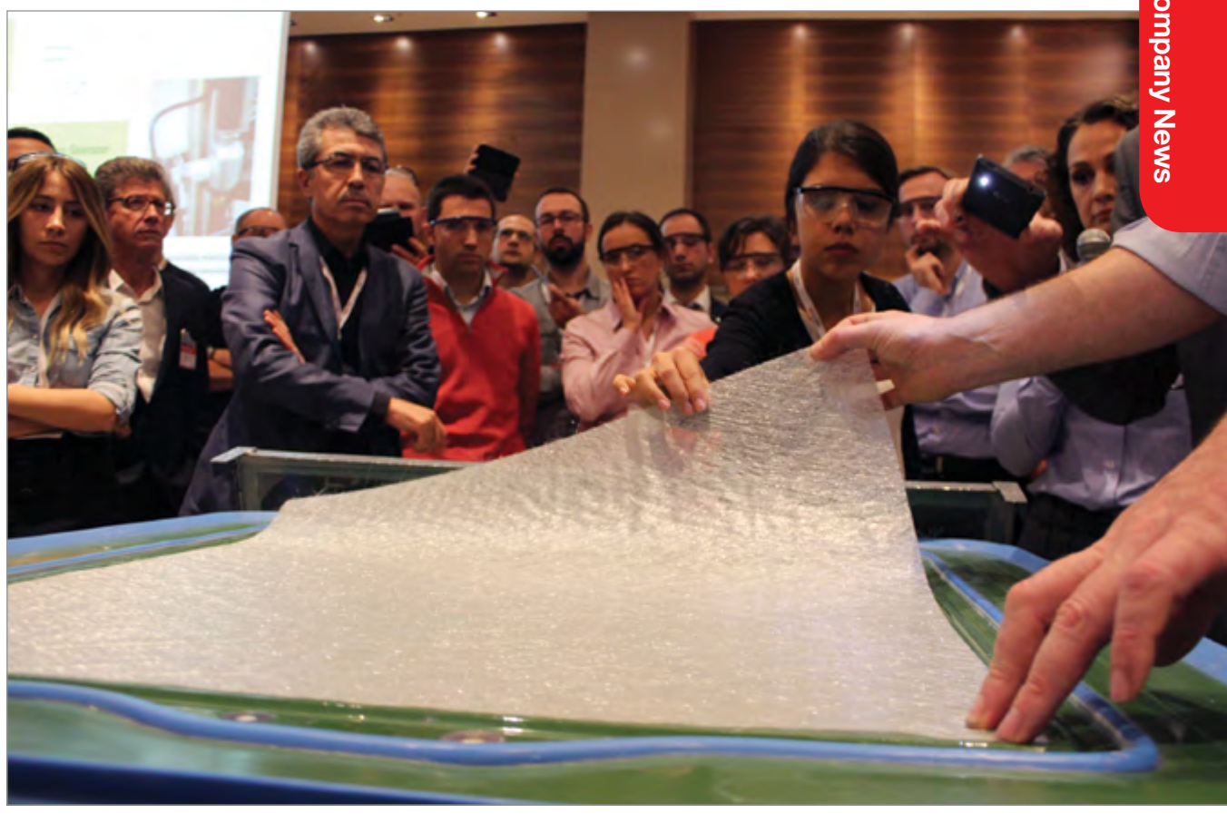
Day 2 - RTM School

Both the RTM School and Infusion Training were led by METYX Composites' long-time partner, Composite Integration. UK-based Composite Integration