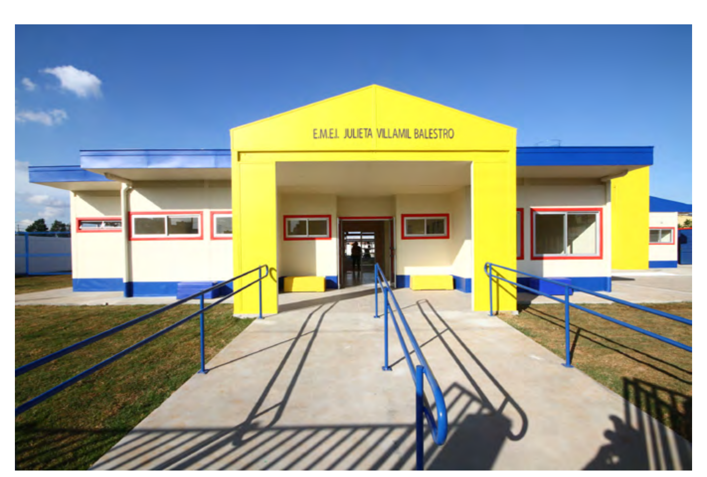
School Constructed with Wall System

expand operations to meet the demand for this innovative product, which has proved capable of helping entire communities of people in need of housing and schools.