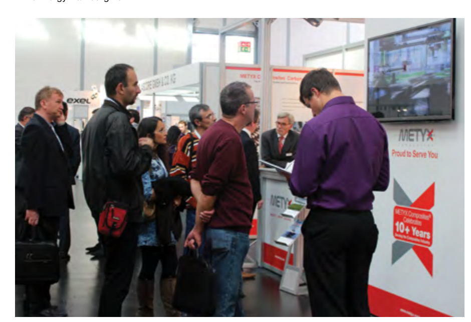
Composites Europe 2014